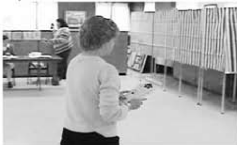
The voter heads for a private marking booth. A large poll site can have dozens of marking booths where many voters can mark their ballot at the same time.