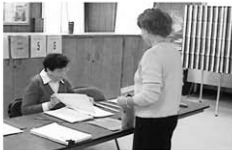
A voter walks in and registers at the check-in table.