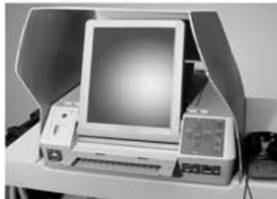
A Ballot-Marking Device ("BMD") for voters with disabilities and/or minority languages. "BMDs" are portable and a poll site can have several of them.

According to Ms. Scarpa, the pollworkers for this system passed their training "With flying colors!" There were no lines on election day: "People got right in and right out." The one scanner easily handled all 3,200 voters of Lee, MA. who turned out that day!