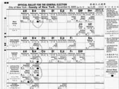
An example of a New York City paper ballot. The voter fills in the little oval next to the candidate's name.

The voter marks her ballot in the booth. Usually the ballot has little circles that the voter fills in, similar to standard test forms in school.