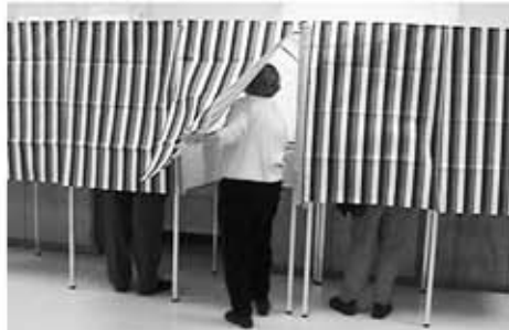
The voter enters an available marking booth to privately mark her ballot.