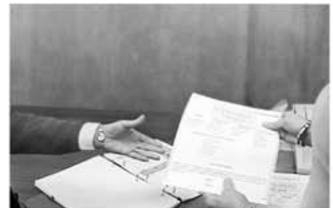
After signing in, the poll worker hands the voter a new, unmarked Paper Ballot.