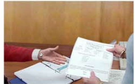
After signing in, the poll worker hands the voter a new, unmarked Paper Ballot.