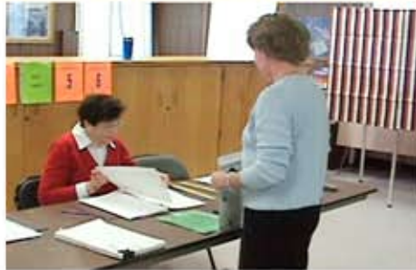
A voter walks in and registers at the check-in table.