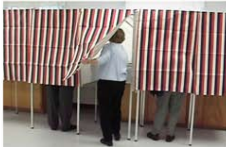
The voter enters an available marking booth to privately mark her ballot.

The voter heads for a private marking booth. A large poll site can have dozens of marking booths where many voters can mark their ballot at the same time.