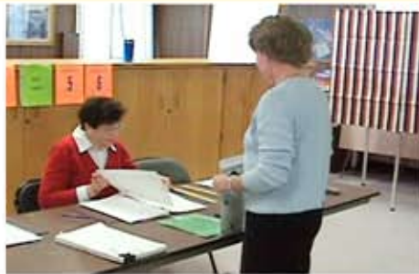
A voter walks in and registers at the check-in table.